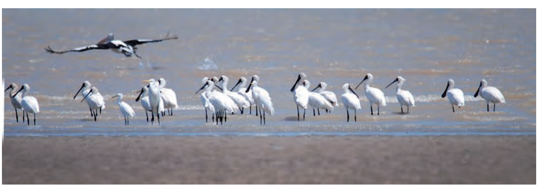
Plate 5. A group of Royal Spoonbills Platalea regia and an Australian Pelican Pelecanus conspicillatus at Oebelo flats, Kupang Bay, 8 September 2012.

Birdwatching tours, individual birdwatchers and ornithologists now regularly visit parts of the Bay, particularly Pan Muti and the Bipolo fishponds. Recent notable records include three Asian Dowitcher and 120 Black-tailed Godwit, including one bird ringed in Roebuck Bay, Western Australia (Robson 2011a, b), and some of the first records of vagrant Masked Lapwing Vanellus miles, including six at Bipolo in August 2005 (Trainor et al. 2009). Sunda Teal Anas gibberifrons are regularly reported and Grey Teal Anas gracilis has also recently been observed and photographed (Eaton 2011).