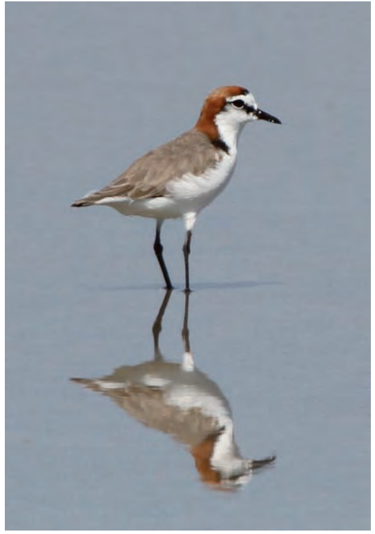
Plate 4 . Male Red-capped Plover Charadrius ruficapillus in breeding plumage at Tambak Merdeka, Kupang Bay, 15 August 2012.

capped Plover, Vulnerable Eastern Curlew Numenius madagascariensis, Near Threatened Black-tailed Godwit Limosa limosa, Red-necked Stint Calidris ruficollis, Curlew Sandpiper C. ferruginea and Sharp-tailed Sandpiper C. acuminata. The Vulnerable Great Knot Calidris tenuirostris was recorded as were resident Beach Thick-knee Esacus neglectus and Malaysian Plover Charadrius peronii (both Near Threatened). Andrew referred to 'thousands' of Oriental Pratincole Glareola maldivarum but no further details were given (Andrew 1985, Wetlands International Indonesia Programme 2014).