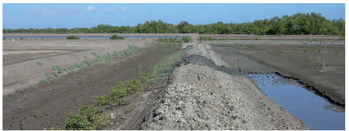
Plate 2. Bipolo fishponds, Kupang Bay, 11 June 2004. Plate 3. Extensive mudflats at Kuka (Pan Muti), Kupang Bay, 10 June 2004.