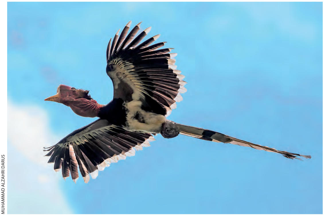
Plate 1. Male Helmeted Hornbill Rhinoplax vigil in flight, Hulu Terengganu, Malaysia, 28 August 2015.

Hornbill casques are hollow, supported internally by bony ridges and rods, except in the case of Rhinoplax, in which the front section of the casque is solid keratin, making the skull so heavy that it comprises over 10% of the bird's body weight (Kemp 2001). Males use this feature in a form of head-to-head 'combat'—aerial casquebutting, otherwise known as aerial jousting—the extraordinary but little-known behaviour which appears to occur as a contest for access to fruiting fig trees (but was once also seen between a paired