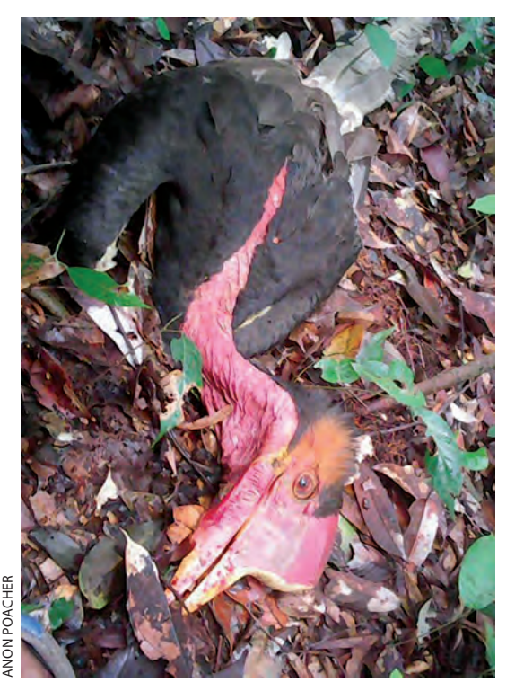
Plate 9. Helmeted Hornbill shortly after being killed by a poacher, Murung Raya district, Central Kalimantan province, Indonesia June 2015.

forest (GCF 2015), unsuitable for the species; assuming—wholly improbably—that 45,000 km<sup>2</sup> of the forest estate remain suitable, the number of birds that could have been harvested sustainably in 2013 was the number of birds being harvested every month during that year.