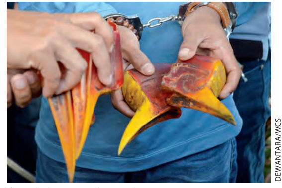
Plates 6 & 7. Helmeted Hornbill casques and weapons confiscated from dealers arrested at Langkat, Sumatra, 12 June 2015.