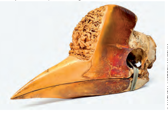
Plates 5. Finely carved Helmeted Hornbill casque in Natural History Museum, specimen registration no. S/2012.1.1.

But in the last five years the species has come under terrible new pressure from an exploding illegal demand for its 'red ivory'. In January 2015 the Environmental Investigation Agency (EIA 2015a) highlighted the threat, indicating that black market prices in China are up to five times higher than for elephant ivory, as increasingly affluent clients seek chic status-enhancing products. In May Hii (2015) published an interview with Yokyok ('Yoki') Hadiprakarsa, who originally studied hornbills with the Wildlife Conservation Society (WCS), with OBC financial support (Hadiprakarsa et al. 2004); he has estimated that in 2013 at least 500 adult Helmeted Hornbills were killed each month in West Kalimantan province alone (6,000 a year) and that between 2012 and 2014 the Indonesian authorities confiscated 1,111 Helmeted Hornbill casques en route to China. In June WCS (2015) reported the arrest on Sumatra of two dealers (Plates 6 & 7) who confessed to selling 124 casques in the previous six months to a Chinese middleman and were believed to have operated a ring of 30 hunters who poached