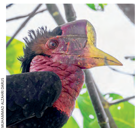
Plate 4. Close-up of male Helmeted Hornbill casque, Hulu Terengganu, Malaysia, 28 August 2015.

male and female, the female remaining perched): two males, sometimes with their female partners following them, fly in opposite directions from a tree, circle back, glide towards each other and collide casque-to-casque with a loud clack , the impact sometimes being so great 'that one or both birds are thrown backwards, performing dramatic, acrobatic flips before righting themselves and flying level' (Kinnaird et al. 2003). Richard Owen and Alfred Newton found structures behind the casque consistent with bracing for a forward impact (see Newton 1896). Selection for size, weight and support of the casque must therefore be strong and continuous.