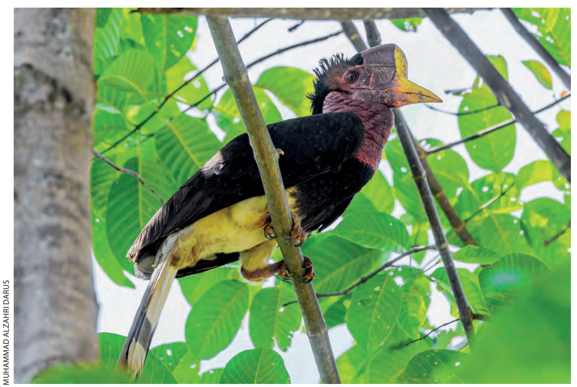
Plate 2 . Male Helmeted Hornbill, Hulu Terengganu, Malaysia, 28 August 2015.