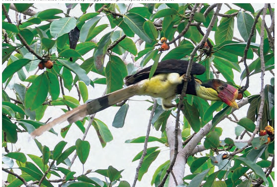
Plate 3. Female Helmeted Hornbill, Buji Tinggi, Pahang, Malaysia, 2 January 2010.

Plate 2 . Male Helmeted Hornbill, Hulu Terengganu, Malaysia, 28 August 2015.