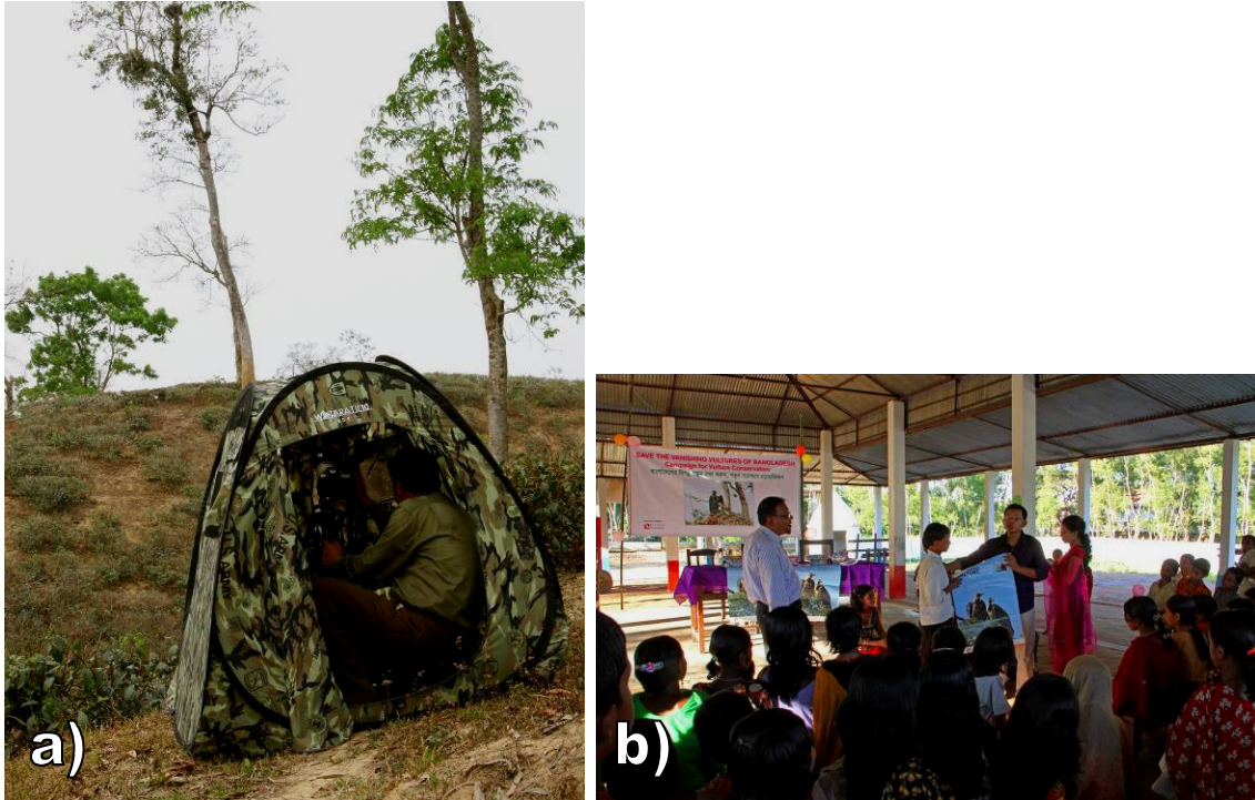
Plate 1. Field activities: a) watching the nest of White-rumped Vulture from a hide, and b) awareness programme for vulture conservation.

The awareness campaign had included popular lectures, interactive discussions, quiz contest, drawing contest for children, photographic contest, and distributing poster and other printed materials (Plate 1b). The veterinary doctors, policymakers, researchers, journalists and other concerned people were invited in order to inform them the adverse effect of diclofenac on vultures and gain their support. Although an alternate to diclofenac, viz. meloxicam, is not yet available in the market, but according to the local veterinary doctors paracetamol and antibiotic can be used as a substitute until meloxicam is available.