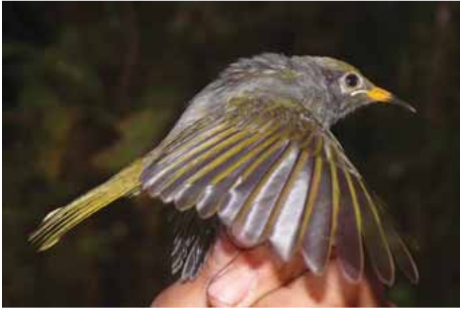
Plate 1. Buru Honeyeater Lichmera deningeri caught at 1,440 m inland from Waikeka, Buru, 13 February 2011.