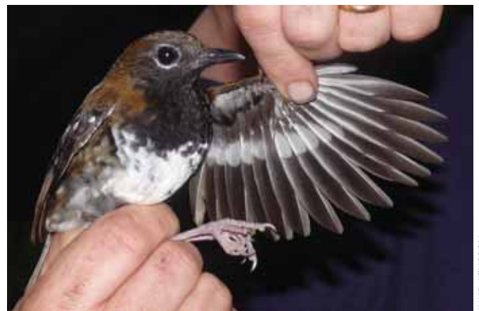
Plate 11. Seram Thrush Zosterops joiceyi female caught at 1,600 m on Gn Binaiya, Seram, 15 February 2012. Note the lack of an eye-ring, the scaled pattern created by the white-edged black feathers of the sides and flanks, the all-black ear-coverts, and the gradation in colour from the rufous-brown crown to the sooty olive-brown mantle, all of which distinguish this species from Buru Thrush (Plate 12). This individual is moulting its white-tipped median wing-coverts, so the single wing-bar pattern formed by these is somewhat obscured.