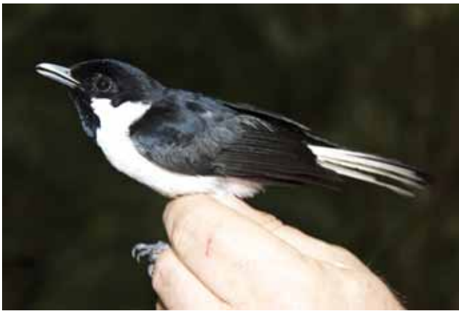
Plate 2. Black-tipped Monarch Monarcha loricatus caught at 700 m inland from Waikeka, Buru, 3 February 2011.