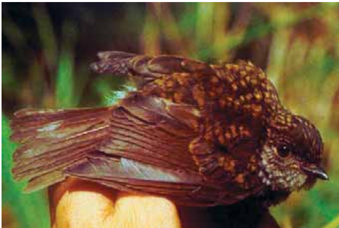
Plate 3. Streaky-breasted Jungle Flycatcher Rhinomyias additus juvenile caught inland from Fogi, Buru, October 1995.