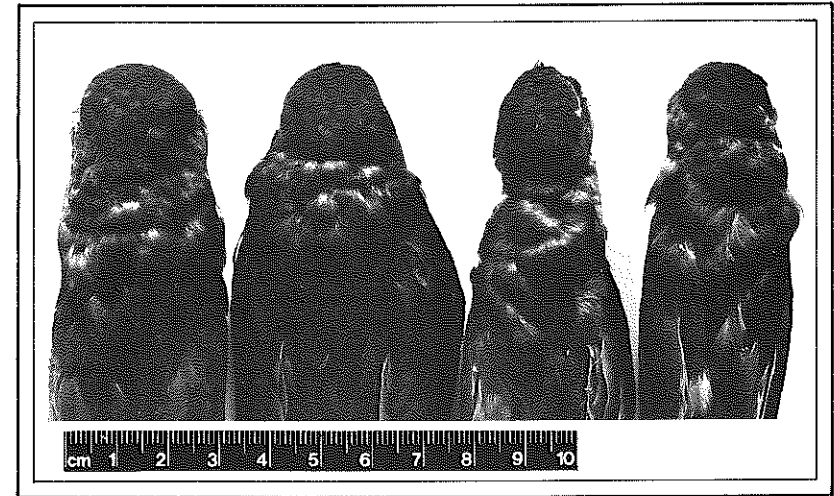
Plate 2. Left to right: BMNH 1897.5.13.290 Collocalia w. whiteheadi from Mt. Data, Luzon; USNM 192161 Collocalia w. origenis from Mt. Apo, Mindanao; BMNH 1911.12.20.959 Collocalia [whiteheadi] nuditarisus from New Guinea; and DMNH 36285 Collocalia apoensis , a syntype, [= C. mearnsi ] previously associated with Collocalia whiteheadi .