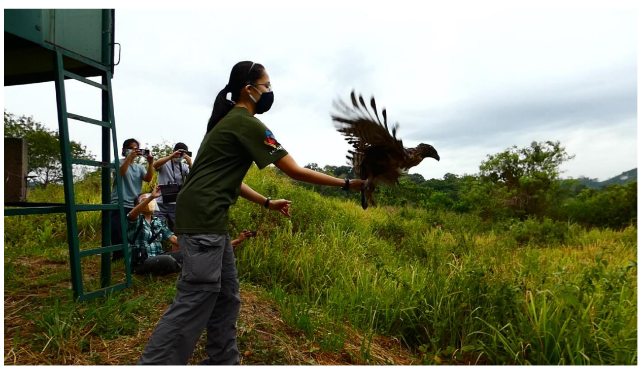
The female North Philippine Hawk-eagle flies free after being tagged with a WT-300 Buzzard tag.