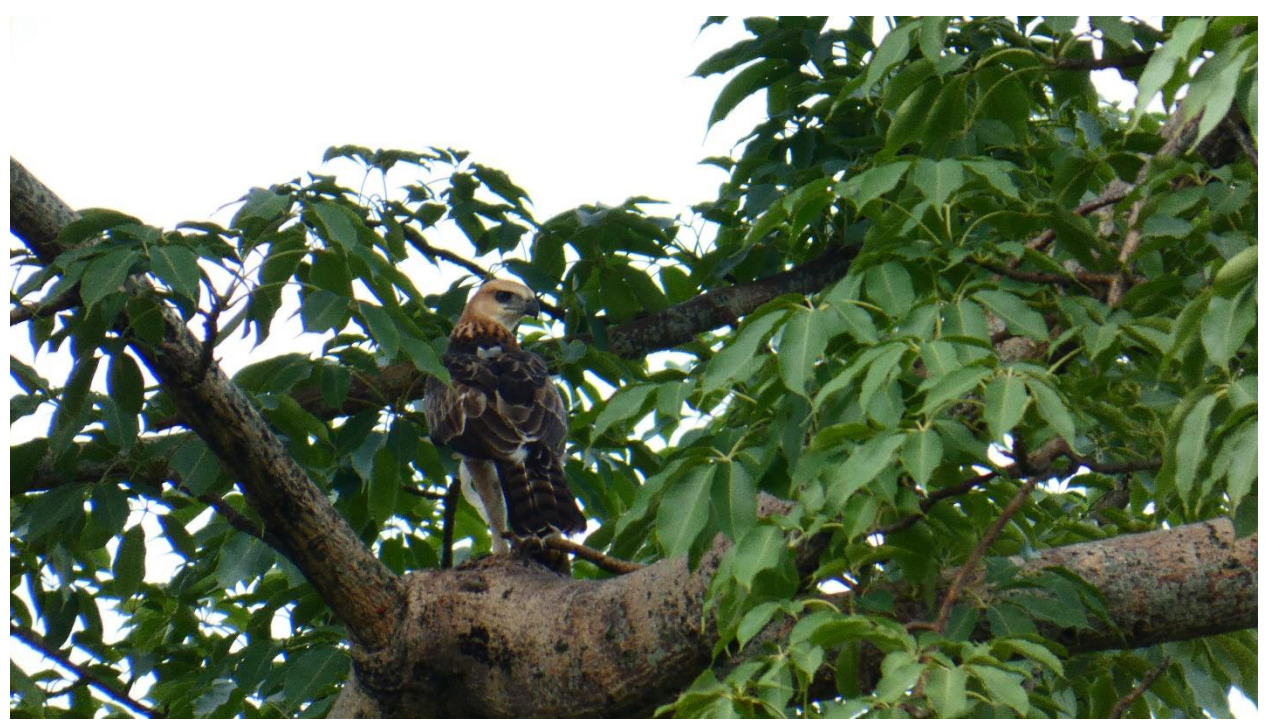
The juvenile North Philippine Hawk-eagle, with the GPS tag on its back, received a rat prey from its parents.