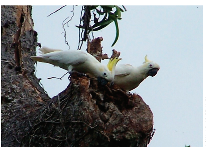
Plate 2. Pair of Yellow-crested Cockatoos Cacatua sulphurea occidentalis at nest-hole in Sterculia foetida tree, March 2006.

During the dry season, May–November, there is very little rainfall, increasing the risk of droughts which usually occur between July and October, the driest part of the year. They also bring the risk of wildfires, which have been known to cause damage in the past.