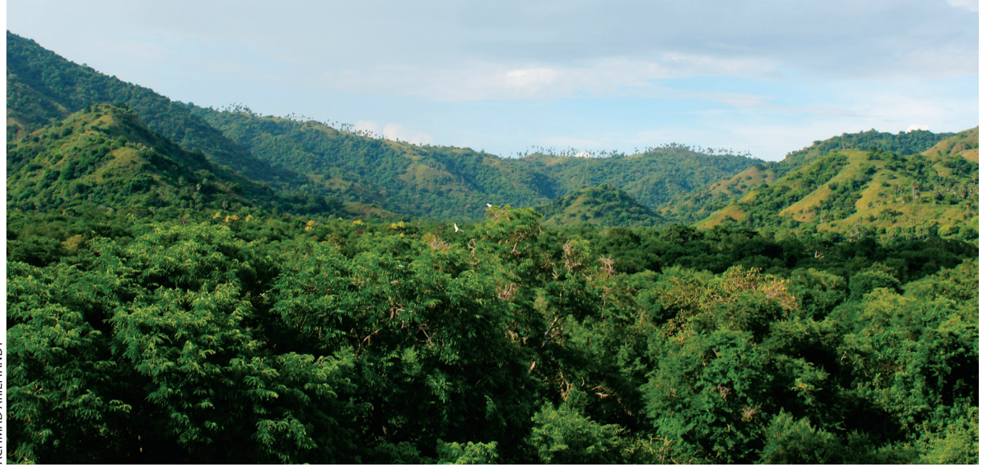
Plate 1. View over the Loh Liang valley showing closed deciduous forest in the valley through to grassy and palm-dominated savannah on ridges, March 2006.

steep to steep slopes and ridges. Komodo Island has a tropical dry climate dominated by the westerly monsoons, with the monsoon season (December–March) bringing most of the rainfall and the south-east trade winds bringing mainly dry weather during the intervening eight months. Annual rainfall (about 800 mm) is lower than neighbouring Flores (Labuanbajo, 948 mm), Sumbawa or Sumba (RePPProT 1989). Droughts and occasional flooding occur.