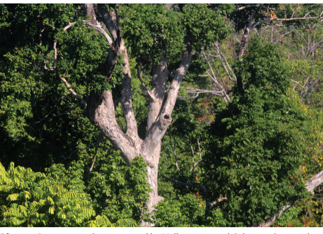
Plate 2. Dracontomelon tree used by Yellow-crested Cckatoo, September 2015.

greater than 50 cm), while that in the west appeared greener and might be more suitable habitat for cockatoos or other parrots.