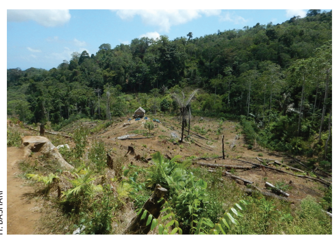
Plate 3. Clearance of forest for a new kebun on Tanahjampea.

breeding success. Nest-tree characteristics of the Sumba Yellowcrested Cockatoo C. s. citrinocristata are: total height 30–40 m, bole height 15–25 m and 59–156 cm diameter at breast height (Djawarai et al. 2014). Unless further deforestation is stopped and large diameter trees (particularly Dracontomelon ) preserved, there will be no future nesting sites for the cockatoos, and the population will rapidly die out.