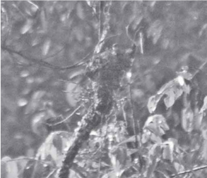
Plate 1. The nest (with one individual of M. dauurica umbrosa inside), Lambir National Park (Sarawak), June 2010. (F. E. Rheindt)