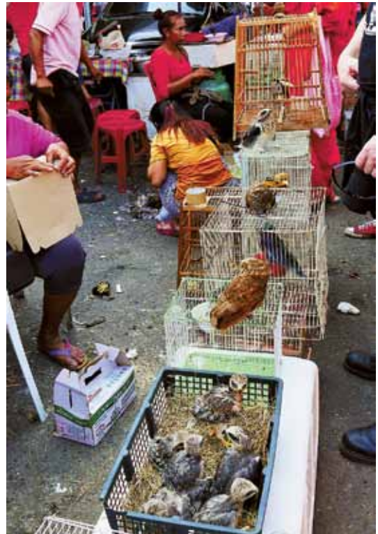
Plate 1. A typical scene at Chatuchak market, Bangkok, Thailand showing the temporary lots used by many traders in native birds, 31 January 2016.

A total of 1,271 birds comprising 117 species from 45 sales outlets were counted during the survey