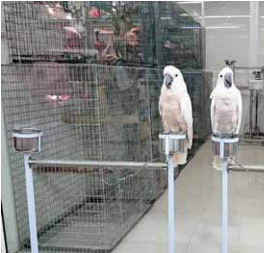
Plate 2. Cockatoos for sale in a fixed shop lot at Chatuchak market, 30 January 2016.

(Appendix 1). Although this equates to an average of 28 birds per stall, 50% of the shops had 14 or fewer individuals, while on the other hand one shop had 382 birds and a further three had between 50 and 90 birds. Only four shops had more than 10 different species for sale, whilst 12 had only one species.