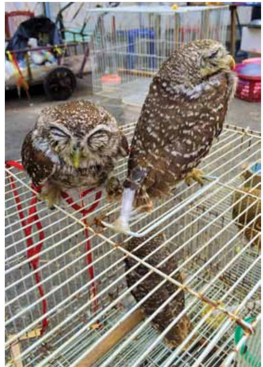
Plate 3. Owls for sale in a temporary lot, Chatuchak market, 19 December 2015.

The high demand for pet owls appears to continue and may be in part due to the 'Harry Potter' films (Ahmed 2010). During this survey we recorded 17 individuals of three species, all of which are native to and protected in Thailand (Plate 3), indicating that the animals were being illegally traded. Most of these birds appeared to be in poor condition, gaping and lying on their side with wings partially spread (indicating overheating and dehydration), with some being on the verge of unconsciousness, suggesting a high level of mortality. Several individuals had been adorned with ribbons to make them look more attractive to potential buyers. Neither hunting nor trade are currently listed as threats to any of the owl species