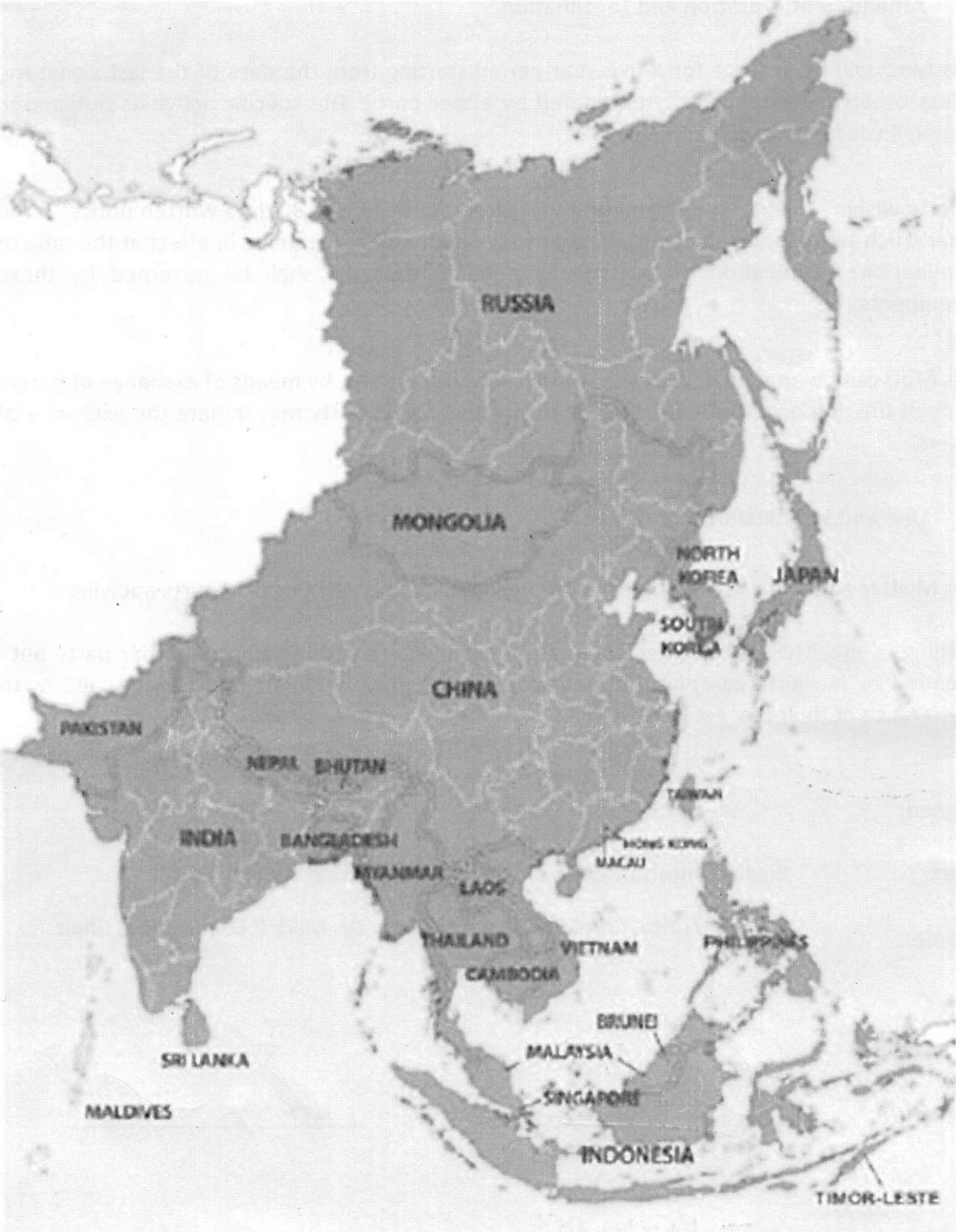
Annex 1 Map of the Oriental region.